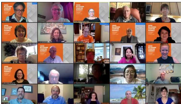
Some of the familiar and friendly faces during BCAN's Virtual Summit for Patients and Families

Once a year, the Bladder Cancer Advocacy Network brings together bladder cancer patients, survivors, and caregivers to share stories, experiences, and information during our annual Summit for Patients and Families.