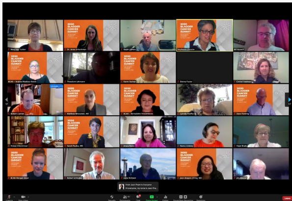
Smiling faces from last year's Virtual Summit.