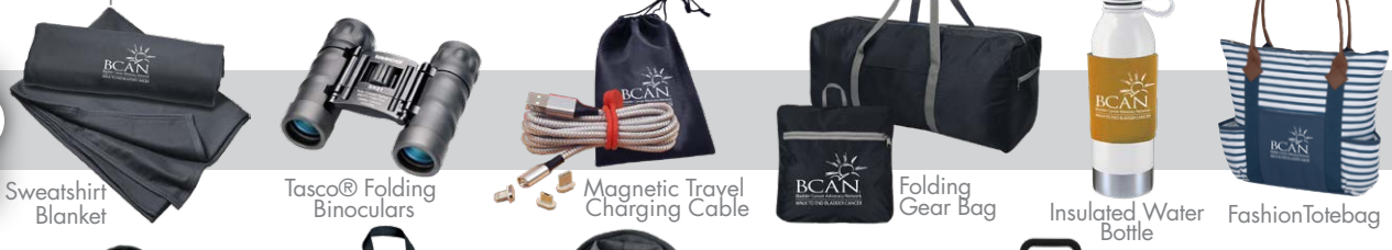
Sweatshirt Blanket Tasco® Folding Binoculars Magnetic Travel Charging Cable Folding Gear Bag Insulated Water Bottle Fashion Totebag