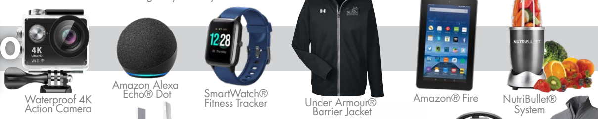
Waterproof 4K Action Camera Amazon Alexa Echo® Dot SmartWatch® Fitness Tracker Under Armour® Barrier Jacket Amazon® Fire NutriBullet® System