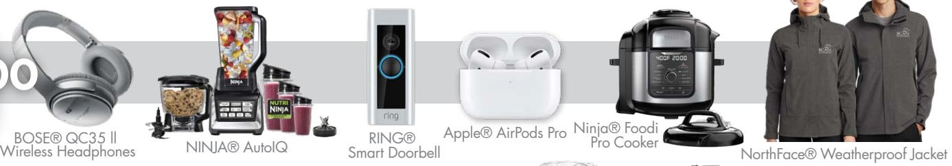
BOSE® QC35 II Wireless Headphones NINJA® AutoQ RING® Smart Doorbell Apple® AirPods Pro Ninja® Foodi Pro Cooker NorthFace® Weatherproof Jacket