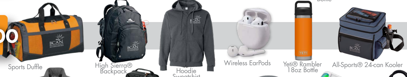
Sports Duffel High Sierra® Backpack Hoodie Sweatshirt Wireless EarPods Yeti® Rambler 18oz Bottle All-Sports® 24-can Cooler