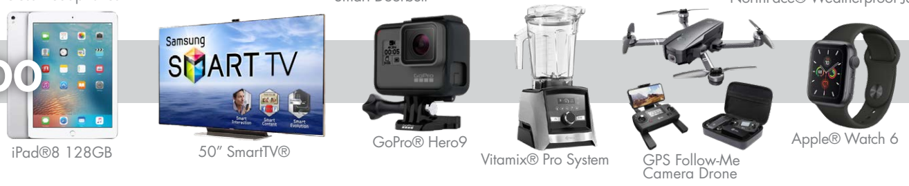
iPad® 8 128GB Samsung 50" SmartTV® GoPro® Hero9 Vitamix® Pro System GPS Follow-Me Camera Drone Apple® Watch 6

* * All fundraising rewards are awarded to individual fundraisers (not valid for team fundraising). Reward items are subject to change due to manufacturer availability. Levels not accumulative (Please choose one reward at the fundraising level earned or lesser value). The online link to redeem your reward will be sent after fundraising closes.