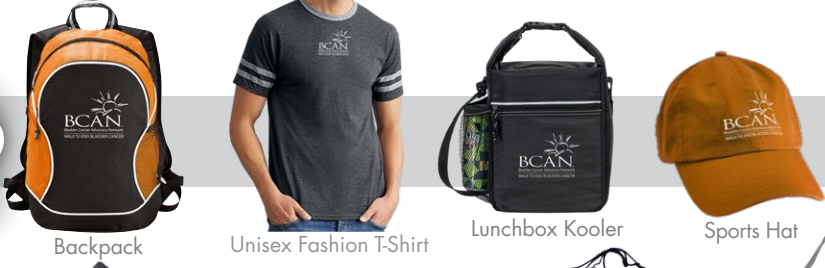
Backpack Unisex Fashion T-Shirt Lunchbox Cooler Sports Hat