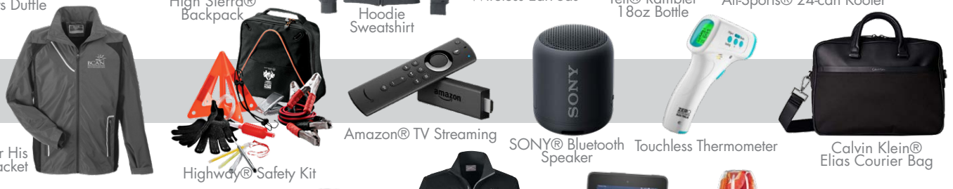
Team365® Hers or His All Weather Jacket Highway® Safety Kit Amazon® TV Streaming SONY® Bluetooth Speaker Touchless Thermometer Calvin Klein® Elias Courier Bag