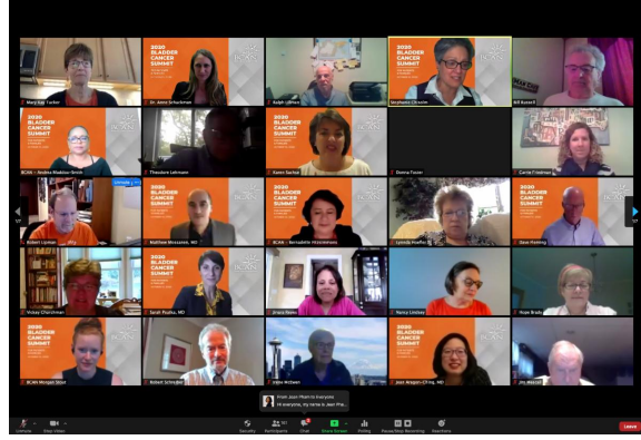
Familiar faces from the 2020 Summit