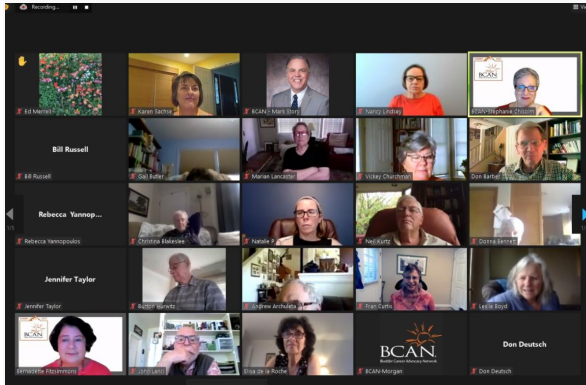
Familiar faces from the 2021 Summit for Patients and Families

BCAN's Summit for Patients and Families took place on October 9, 2021. Hundreds of patients, caregivers and medical and research professionals shared stories, experiences, and information about the disease.