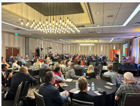
Above: picture of the main room where the Summit took place at the Sonesta Airport in Nashville, TN.

We also invite you to visit our web page on bladder preservation for more information.